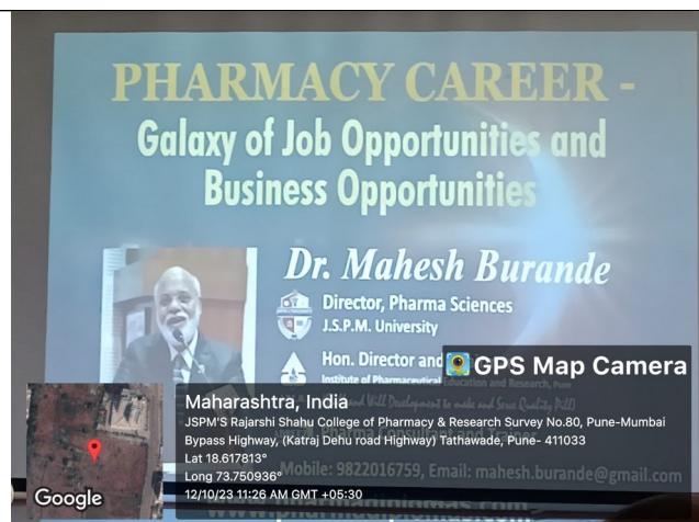
Pre-Placement Talk presentation